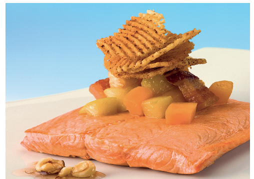
Pan Seared Wild BC Sockeye Salmon

The sockeye fishery is managed under a conservation-based regime that permits controlled harvest to protect weaker stocks as they rebuild.