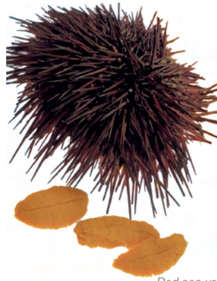
Red sea urchin with roe (front)

Canadian Nutrient File, Health Canada, 2007