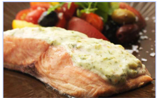
Wild BC Pink Salmon Baked with Tartar Sauce

The pink salmon fisheries are managed under a conservation-based regime that permits controlled harvest to protect weaker stocks.