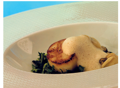
Seared Scallops and Poached Oysters with a Soy Ginger and Hijiki Broth

Eating raw shellfish or shellfish harvested from areas with "red tide" increases the risk of infection, especially for people in high-risk health categories.