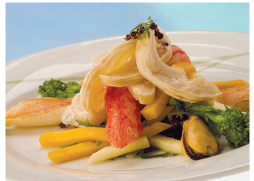
West Coast Seafood Salad with Geoduck

Geoduck conservative quotas allows a total annual harvest of only 1.2% to 1.8 % of the estimated biomass of the animal.