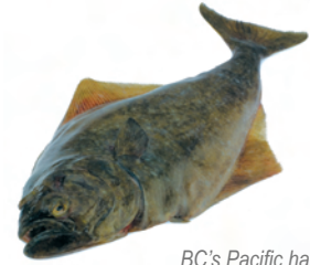
BC's Pacific halibut

Eco-certification is a market-based measure intended to improve the sustainability of fisheries. It aims to raise consumer awareness and retailers' demands for sustainable products. Third party eco-certification is becoming increasingly critical in maintaining the industry's reputation with the domestic and international public, and access to the global markets.